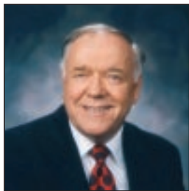
Kenneth E. Hagin

The Lord has set before us wonderful doors of opportunity, blessing, and provision. What's more, they are not closed doors, but they are wide open doors of divine blessing!